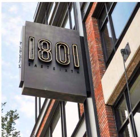
Example of projection sign