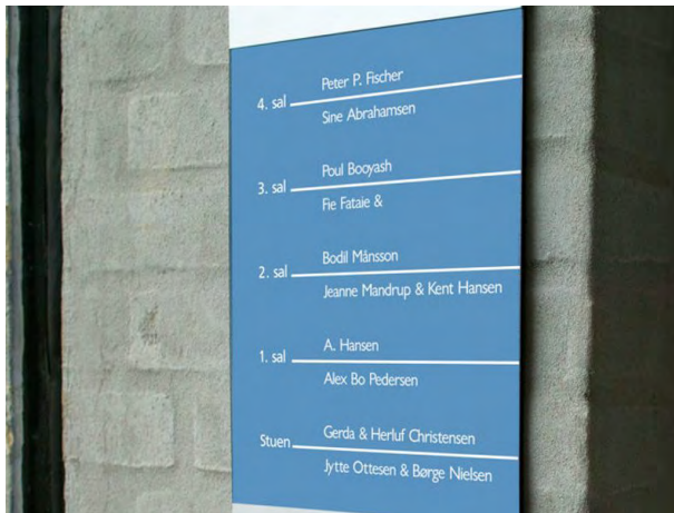
Example of building mounted directory Sign