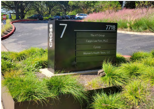
Example of freestanding directory sign