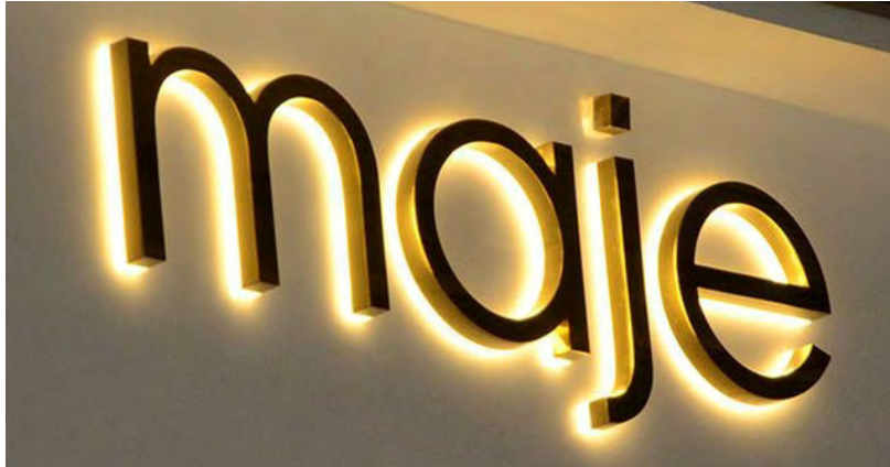
Example of reverse channel letters